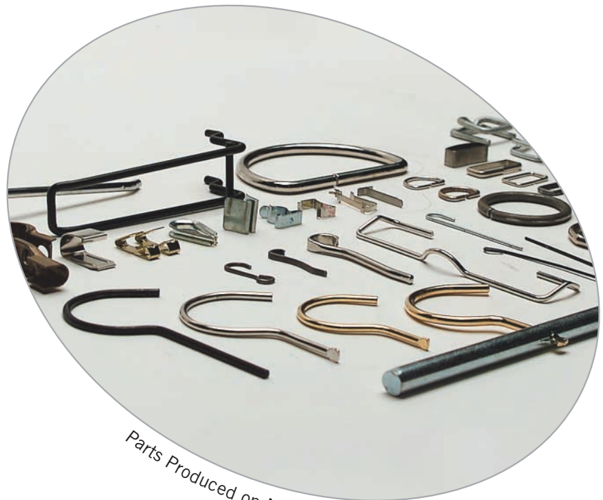
Parts Produced on Multiform Machines