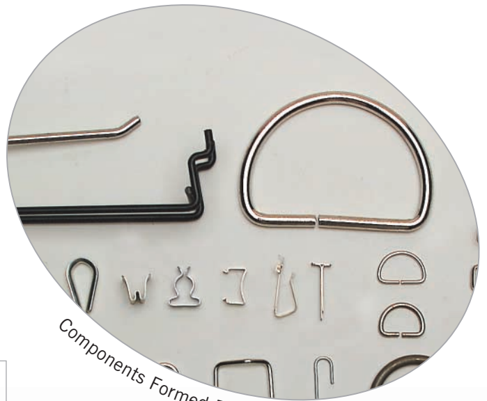
Components Formed From Strip Metal

For more information please contact us or visit our website www.fairfit.co.nz